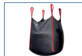
Big Bag Geo-Textile fabric 190 gr/sqm